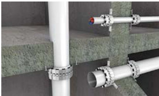
Fig 1 : Usage of fire collars in both horizontal and vertical installations.

This product can be used for diameters of 20 - 200 mm.