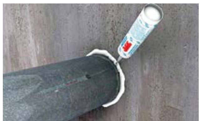
Fig 2 : Application of acrylic sealant at the joints for sealing purposes.