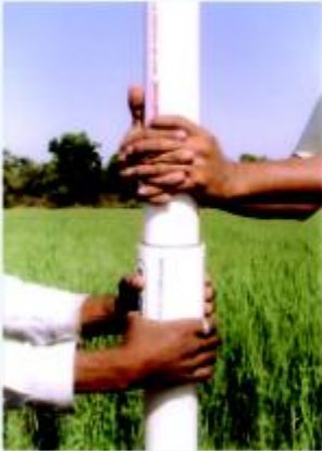
Before opening or joining the pipe/adopter ensure to hold the coupler by hand.