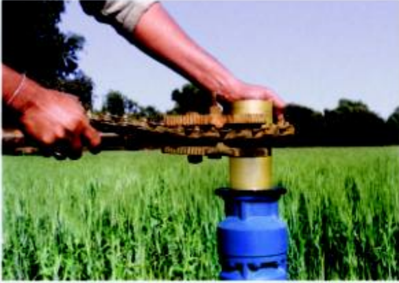
Join the Metal connector with Submersible pump with the help of chain wrench