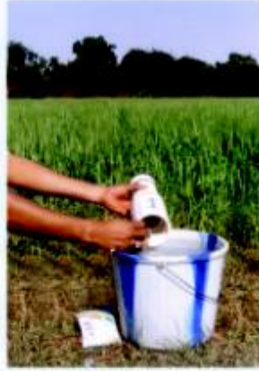
Before joining the pipes, ensure to clean the threads with clean water.*