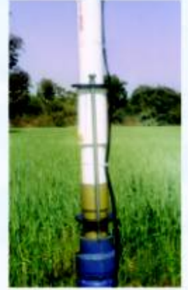
Before joining the pipes ensure that the Pump Guard is installed properly.