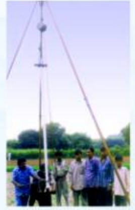
Lower pipes with the help of chain pulley.

The Pipe that even tractors concede defeat