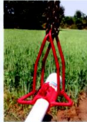
At the time of lowering pipes place the clamp below the coupler. Clamp the top adopter with the last pipe.