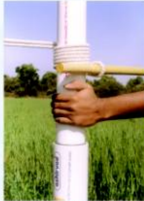
Tighten pipe till half rubber ring is seen with hand and last jerk with rope if required.